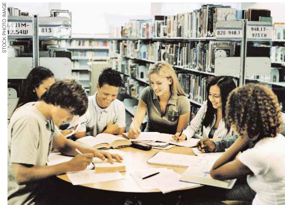
Grouping students of varying abilities requires a shift toward nontraditional instructional strategies.

Heterogeneous grouping is popular with some educators because they think that it establishes fairness among teachers. It also puts every student in a challenging class. “When you put a stupid kid in a stupid class, you get stupid results,” said one teacher. Some teachers also believe that students from the